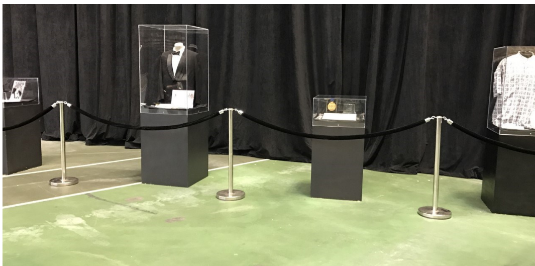
Items from the International Jazz Collections were on display in the Kibbie Dome and the new IRIC building during the 50th Lionel Hampton Jazz Festival.

Special Collections and Archives was a campus leader in celebrating the 50th Anniversary of the Lionel Hampton Jazz Festival by hosting a variety of exhibits and events featuring the International Jazz Collections. During the festival there were six exhibits on campus and Moscow, the largest of which is still on the display on the library second floor.